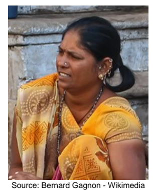
Population: 44,000 World Popl: 685,000 Total Countries: 2

People Cluster: South Asia Hindu - other