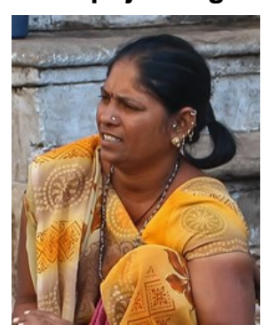
Population: 44,000 World Popl: 685,000 Total Countries: 2

People Cluster: South Asia Hindu - other