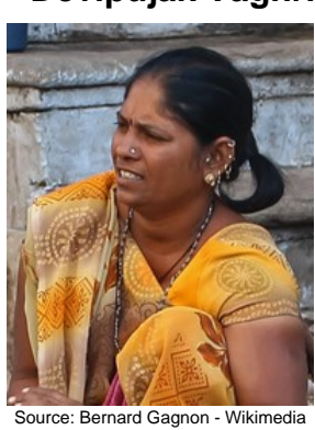
Population: 44,000 World Popl: 685,000 Total Countries: 2

People Cluster: South Asia Hindu - other