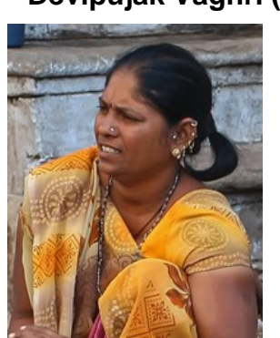
Population: 44,000 World Popl: 685,000 Total Countries: 2

People Cluster: South Asia Hindu - other