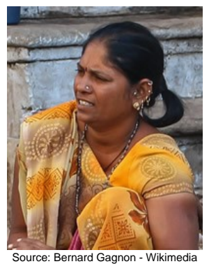
Population: 44,000 World Popl: 685,000 Total Countries: 2

People Cluster: South Asia Hindu - other