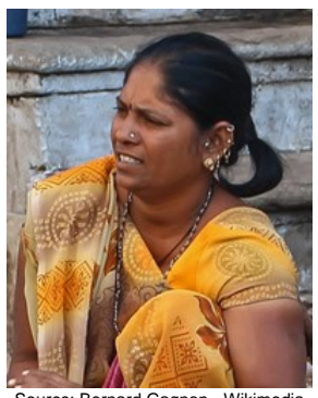
Population: 44,000 World Popl: 685,000 Total Countries: 2

People Cluster: South Asia Hindu - other