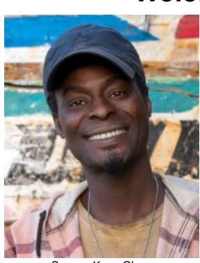
Population: 22,000 World Popl: 7,007,200

Total Countries: 17 People Cluster: Atlantic-Wolof