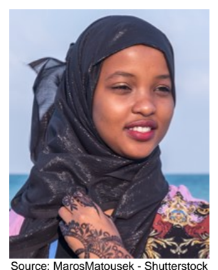
Population: 183,000 World Popl: 28,530,500 Total Countries: 35 People Cluster: Somali Main Language: Somali Main Religion: Islam