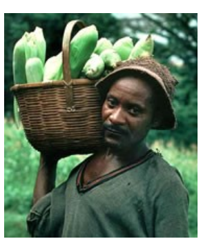
Population: 105,000 World Popl: 1,434,000