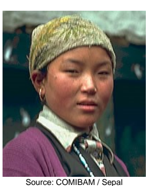
Population: 121,000 World Popl: 188,400 Total Countries: 5