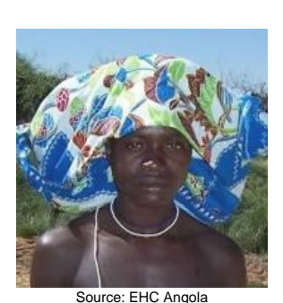
World Popl: 1,042,000 Total Countries: 3