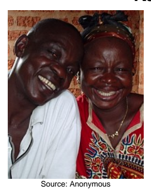
Population: 73,000 World Popl: 194,000 Total Countries: 3

People Cluster: Sara-Bagirmi Main Language: Kabba Main Religion: Christianity