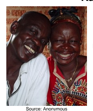
Population: 73,000 World Popl: 194,000

Total Countries: 3 People Cluster: Sara-Bagirmi Main Language: Kabba