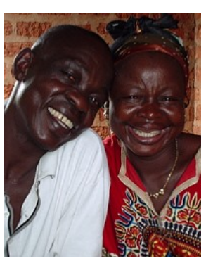
Population: 73,000 World Popl: 194,000 Total Countries: 3

People Cluster: Sara-Bagirmi Main Language: Kabba Main Religion: Christianity