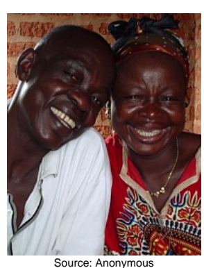
Population: 73,000 World Popl: 194,000 Total Countries: 3

People Cluster: Sara-Bagirmi Main Language: Kabba