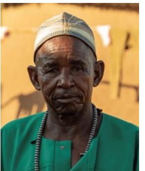
Population: 625,000 World Popl: 2,203,000