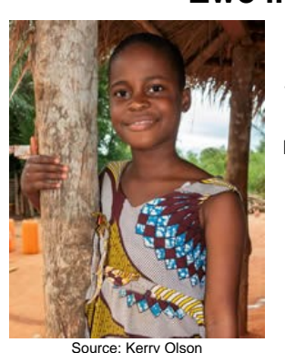
Population: 46,000 World Popl: 6,943,000 Total Countries: 10 People Cluster: Guinean Main Language: Ewe Main Religion: Christianity