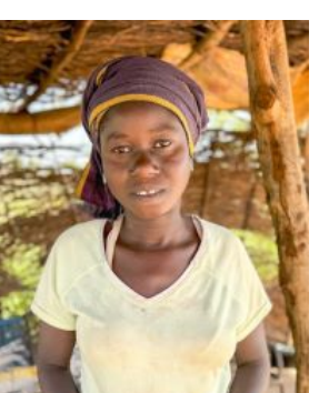
Population: 5,400 World Popl: 7,787,200 Total Countries: 12 People Cluster: Manding

Main Language: Bamanankan Main Religion: Islam