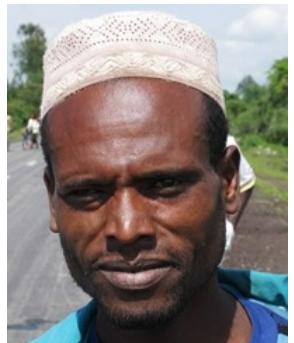
Population: 448,000 World Popl: 448,000 Total Countries: 1 People Cluster: Omotic