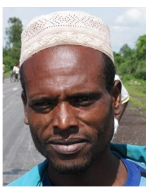
Population: 448,000 World Popl: 448,000

Total Countries: 1 People Cluster: Omotic