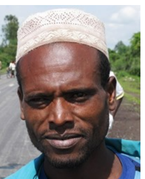
Population: 448,000 World Popl: 448,000 Total Countries: 1