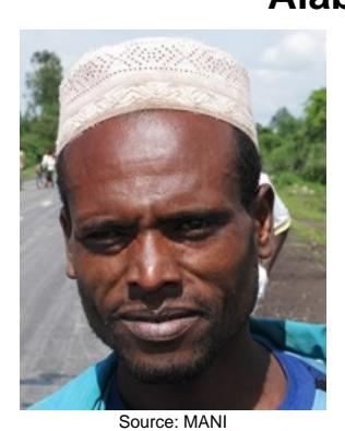
Population: 448,000 World Popl: 448,000 Total Countries: 1 People Cluster: Omotic

Main Language: Alaba-K'abeena Main Religion: Islam