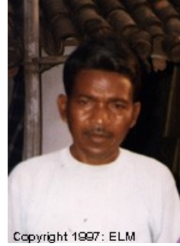
Copyright 1997: ELM Source: Bethany World Prayer Center

Population: 451,000 World Popl: 455,200 Total Countries: 2 People Cluster: South Asia Hindu - other Main Language: Telugu Main Religion: Hinduism Status: ● Unreached Evangelicals: Unknown % Chr Adherents: 1.08% Scripture: Complete Bible