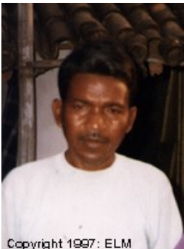
Copyright 1997: ELM Source: Bethany World Prayer Center

Population: 451,000 World Popl: 455,200 Total Countries: 2 People Cluster: South Asia Hindu - other Main Language: Telugu Main Religion: Hinduism Status: ● Unreached Evangelicals: Unknown % Chr Adherents: 1.08% Scripture: Complete Bible