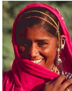
Nepal

Population: 21,994,000 World Popl: 22,404,000 Total Countries: 2 People Cluster: South Asia Hindu - Kunbi Main Language: Gujarati Main Religion: Hinduism Status: ★ Frontier Unreached Evangelicals: Unknown % Chr Adherents: 0.05% Scripture: Complete Bible