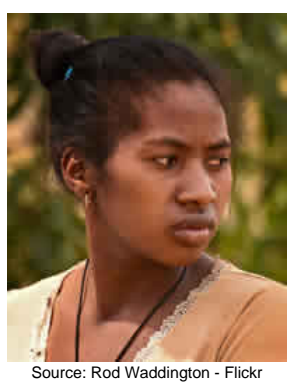
Population: 2,075,000 World Popl: 2,075,000