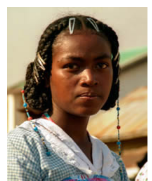
Population: 1,081,000 World Popl: 1,081,000