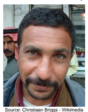
Population: 73,000 World Popl: 22,460,800