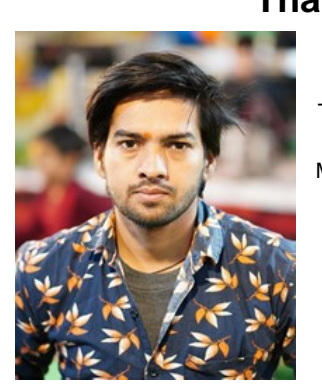
Population: 3,600 World Popl: 24,371,800 Total Countries: 34 People Cluster: Thai Main Language: Thai Main Religion: Buddhism Status: Unreached

Evangelicals: 0.50% Chr Adherents: 1.00%