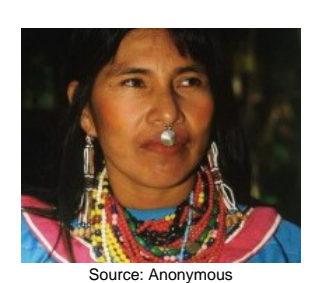
Population: 400 World Popl: 400 Total Countries: 1 People Cluster: Amazon